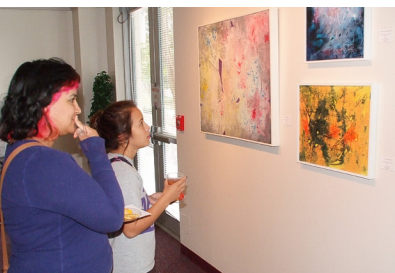
Filipe Reyes exhibit