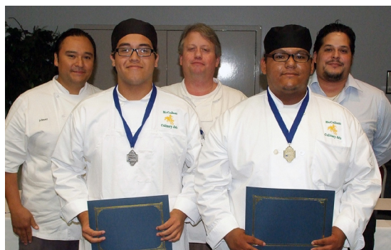
Salsa Scholarship Competition