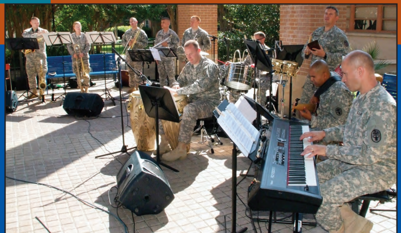
The Latin Army Band provided salsa and merengue music on October 11 during the El Mercado fundraiser on the Campus Green.