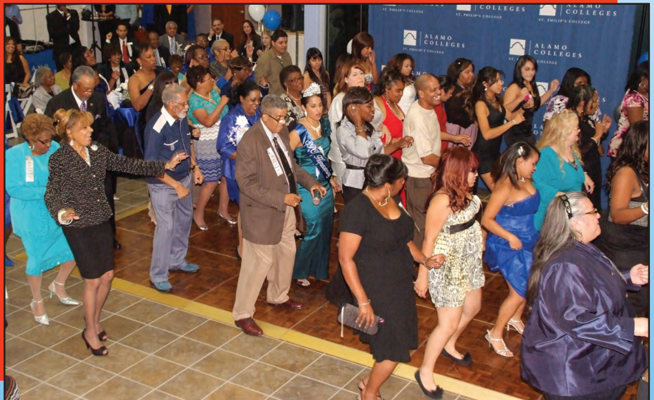
A highly engaged and energized audience hits the dance floor at Homecoming.