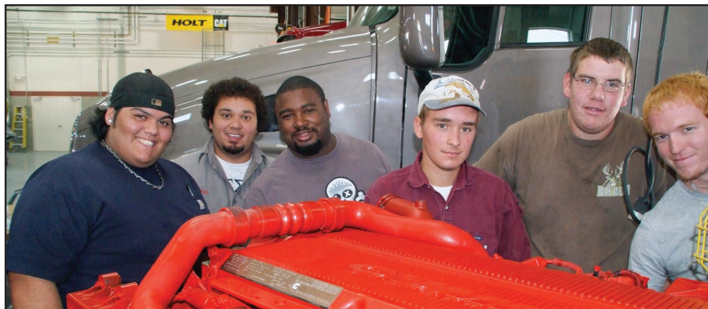
Diesel mechanics program students pose with the new diesel engine donated by Cummins, LLC in a ceremony at the Southwest Campus Diesel Lab.