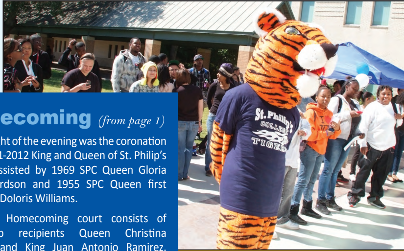
Philip the Tiger at The Haunted Homecoming Pep-Rally.