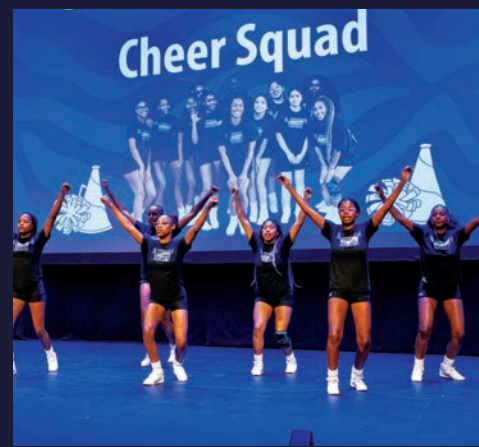
The St. Philip's College Cheer Squad perform at the college's inaugural Royal Court Showcase on Oct. 10.